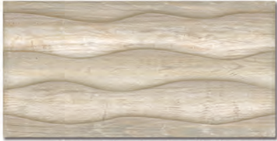
12x24 Jalousie (wall tile only)