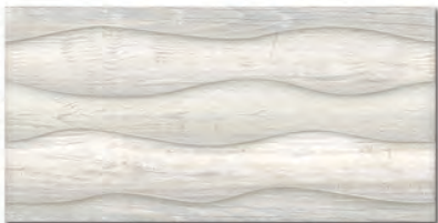
12x24 Jalousie (wall tile only)