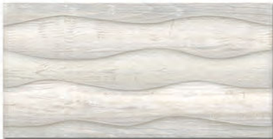
12x24 Jalouse (wall tile only)