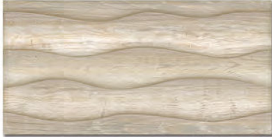
12x24 Jalouse (wall tile only)