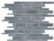
Linear Mosaic (12x16 mesh)