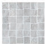
2x2 Basket Weave