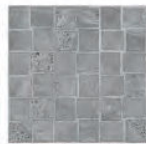
2x2 Basket Weave