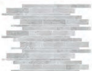
Linear Mosaic (12x16 mesh)