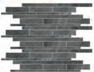
Linear Mosaic (12x16 mesh)