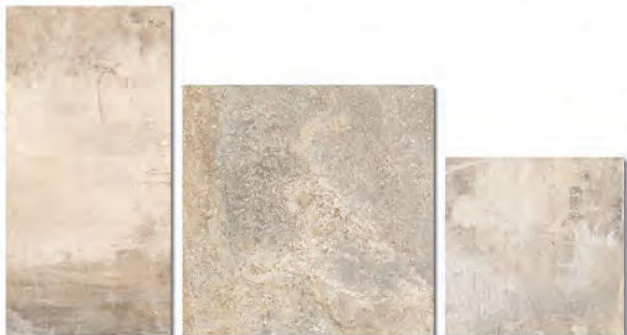
12x24 18x18 13x13 18x36, 2x2 Basketweave, 1x12 Mosaic and 3x12 Sbn also available