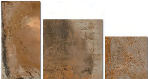
12x24 18x18 13x13 18x36, 2x2 Basketweave, 1x12 Mosaic and 3x12 Sbn also available