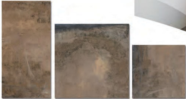
12x24 18x18 13x13 18x36, 2x2 Basketweave, 1x12 Mosaic and 3x12 Sbn also available