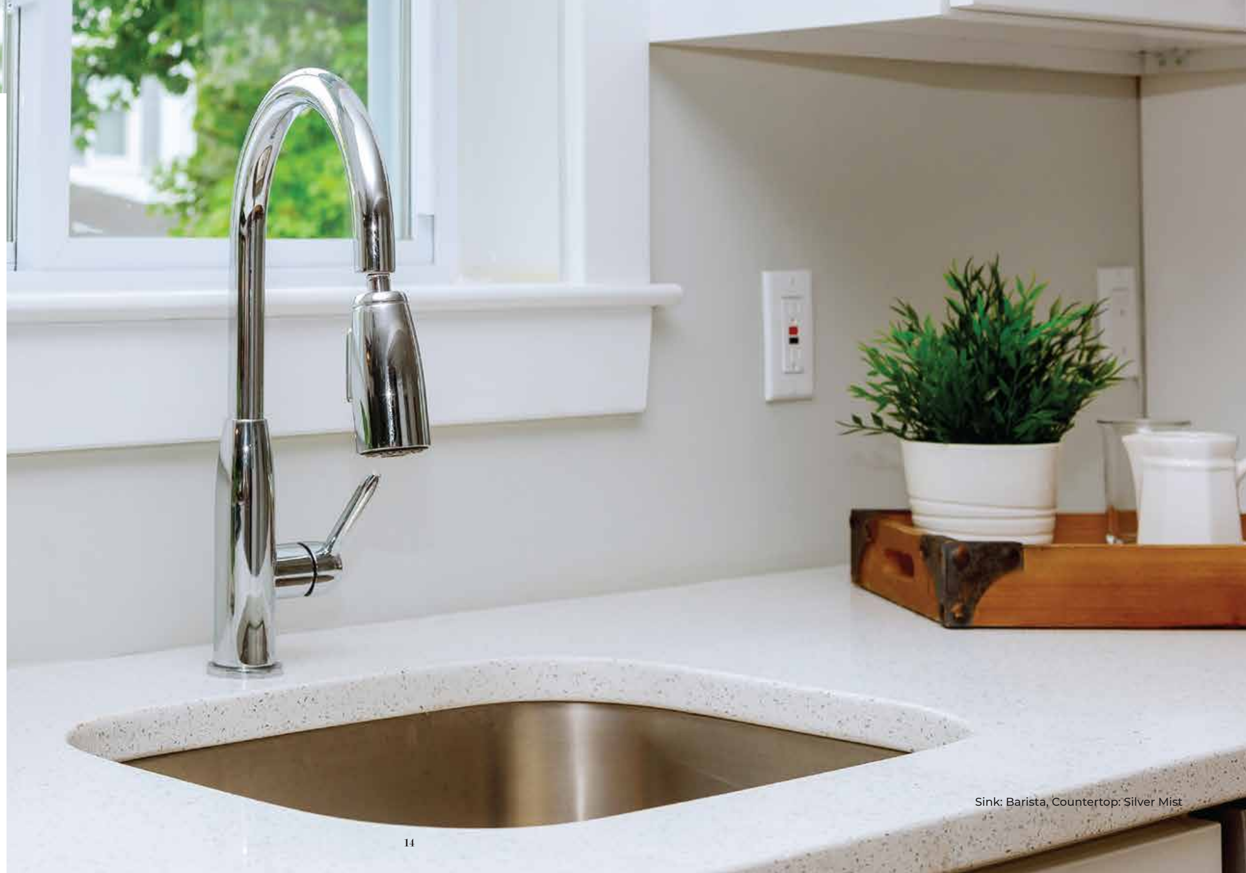
Sink: Barista, Countertop: Silver Mist