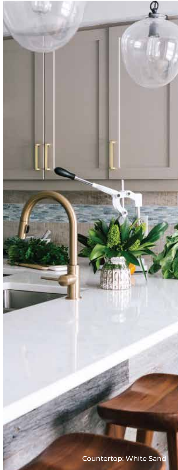
Countertop: White Sand