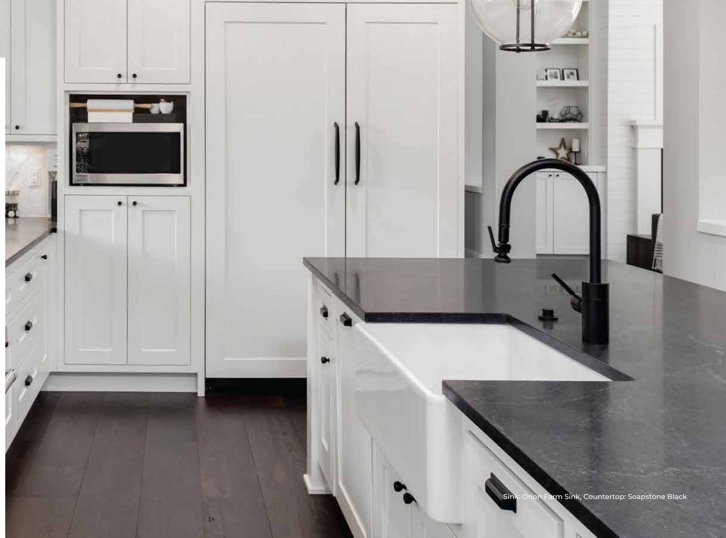
Sink: Orion Farm Sink, Countertop: Soapstone Black