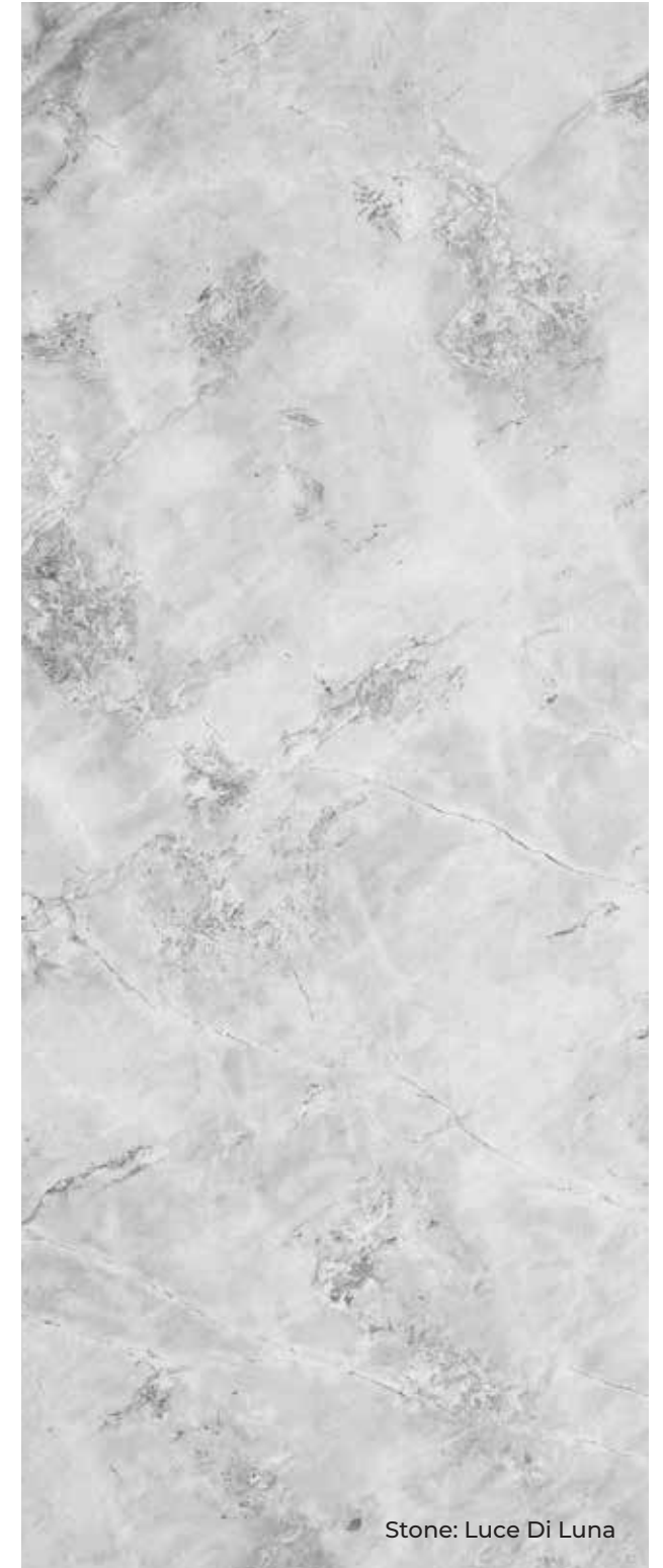
Stone: Luce Di Luna

Natural stone like any surfacing product requires maintenance but, stands out as a unique piece unlike anything anyone has ever owned or created. It can be used anywhere on the interior or exterior of a building including around fireplaces, for flooring, tabletops, countertops, wall claddings, fountains/ water features, feature walls, building facades, steppingstones, etc. The uses and applications of these unique creations are limited only by our imagination.