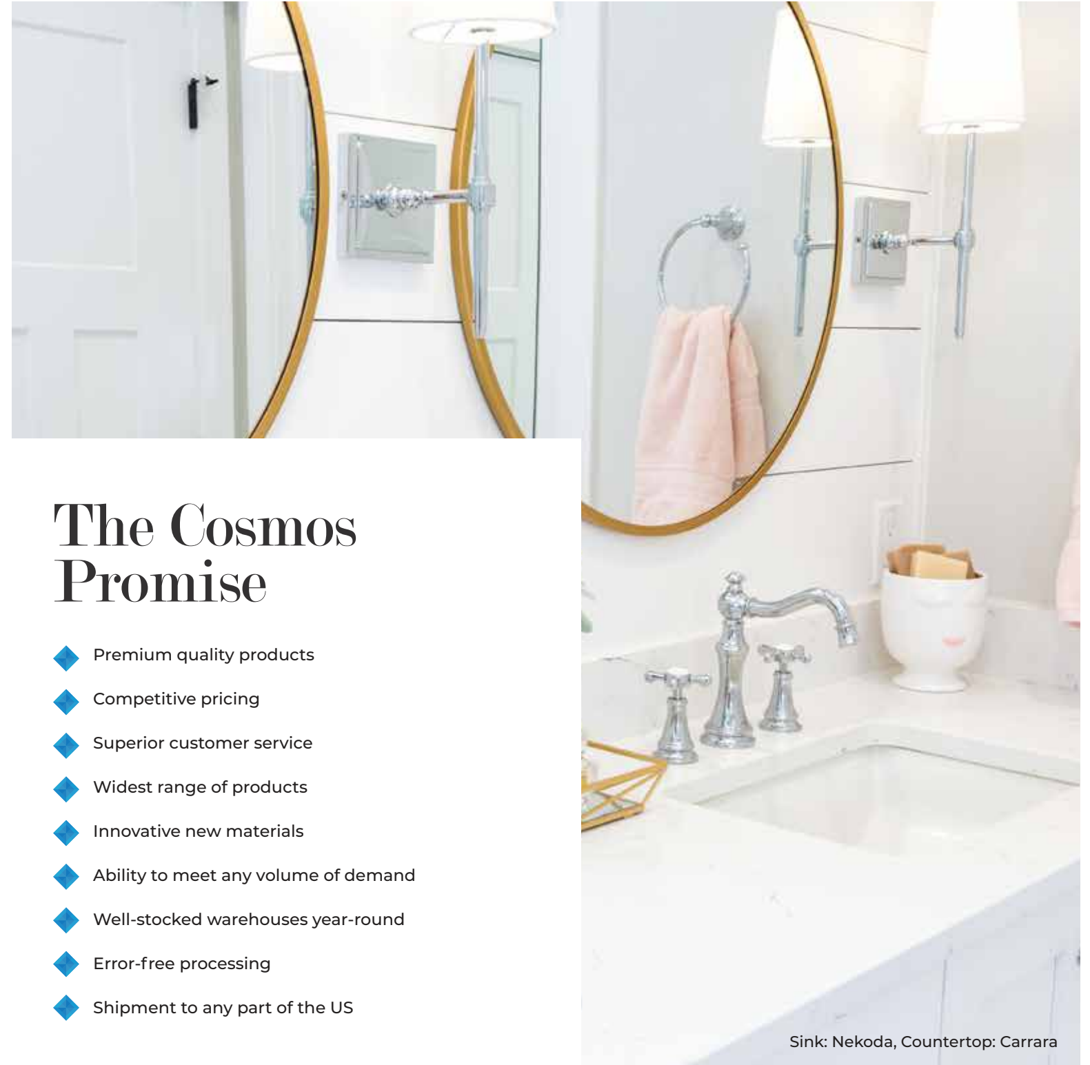
Sink: Nekoda, Countertop: Carrara