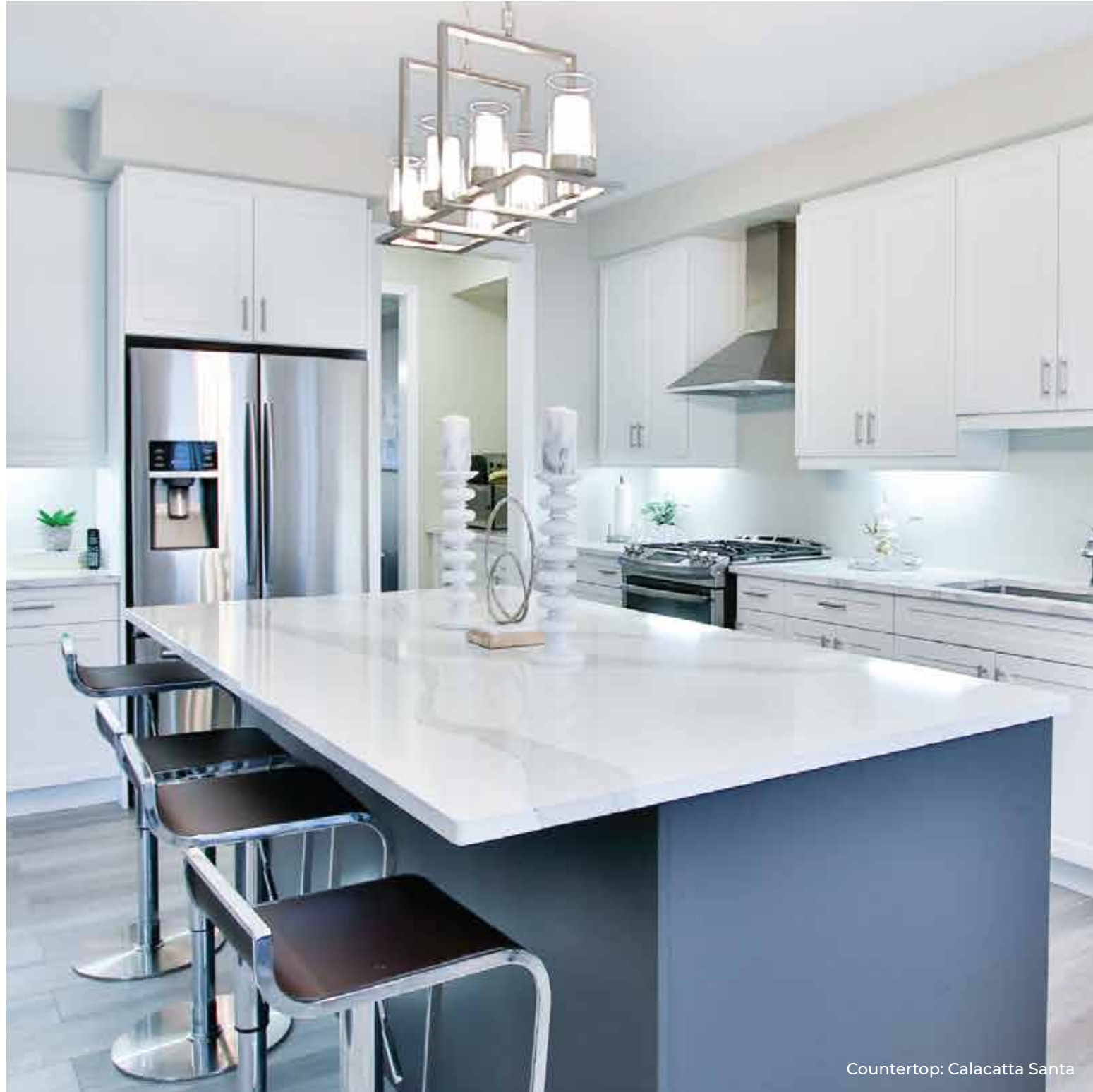
Countertop: Calacatta Santa