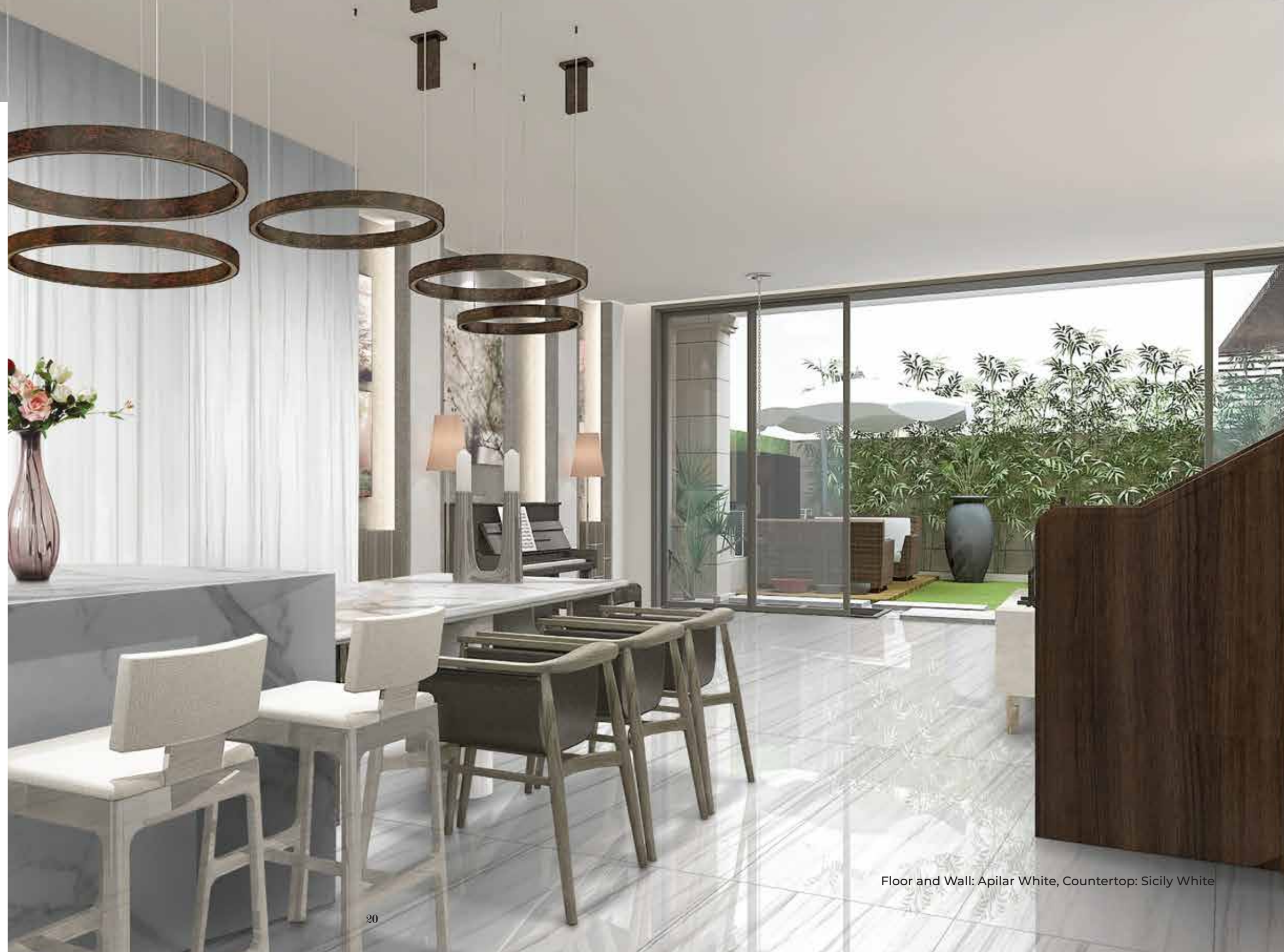
Floor and Wall: Apilar White, Countertop: Sicily White