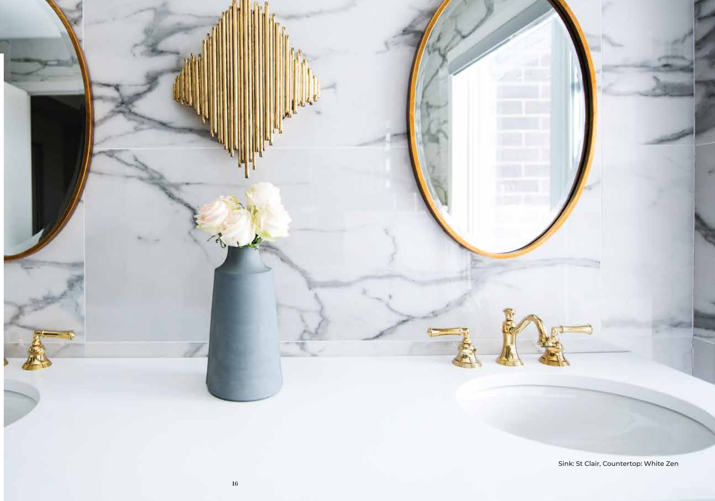
Sink: St Clair, Countertop: White Zen